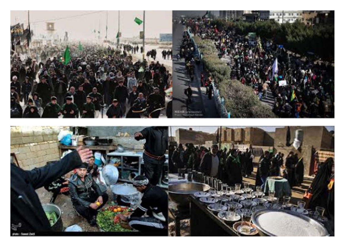
Fig. 2. Pictures showing the Najaf-Karbala walk

The Arbaeen is a time bound pilgrimage and therefore, the initial conversations only assisted to get the ball rolling and establish rapport, collect contact details, judge communication abilities (author was looking for pilgrims who could communicate in English, Urdu, Persian and Gujarati – interviews conducted in languages other than English were translated before transcribing). 28 interviews were conducted of 12 females and 16 males. Participants comprised of people from Tanzania, Canada, United Kingdom, Sweden, Australia, Iraq, Pakistan and Iran, and an age group range from 16 to 60. Interviews lasted from 24 min to an hour and 20 min. Interviews conducted with each in-