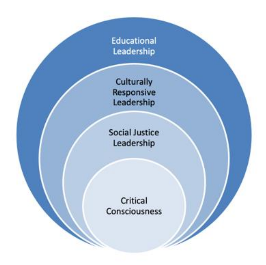
Figure 1-1. Interconnectedness of Conceptual Frameworks