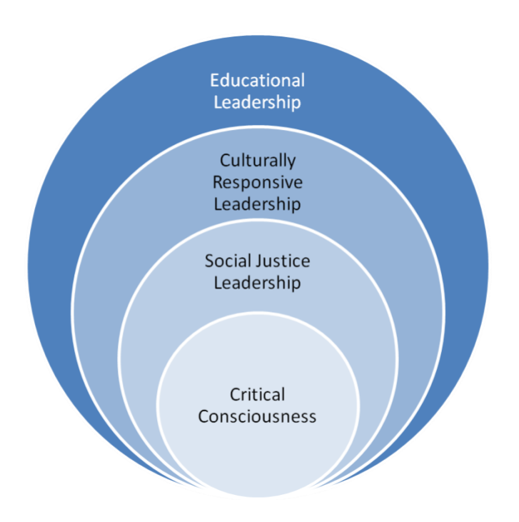
Figure 5-1. Interconnectedness of Conceptual Frameworks Revisited