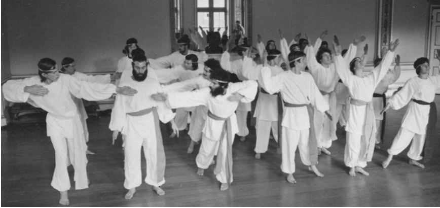
FIGURE 26.1 Enneagram Movement, Sherborne House, 1974