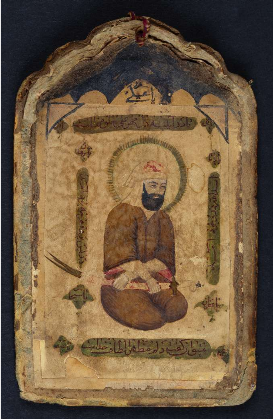
FIGURE 3 Watercolour on paper (15 × 10 cm), inv. no. 2003, 197, 7