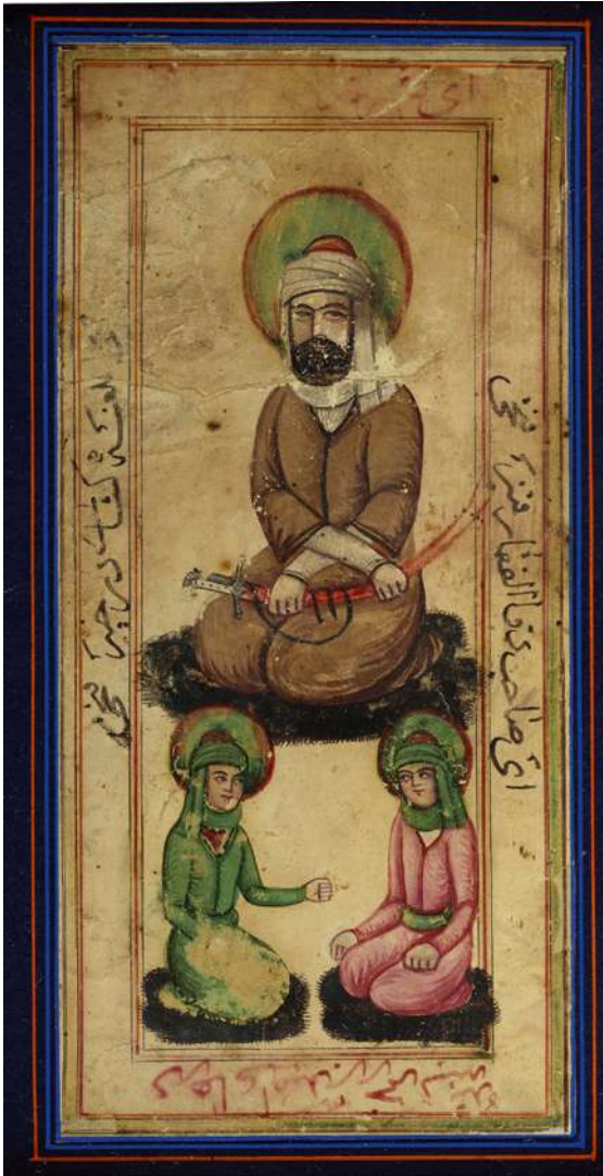
FIGURE 1 Watercolour on paper (13.5 × 6.5 cm), inv. no. 2003, 197, 5 and 10