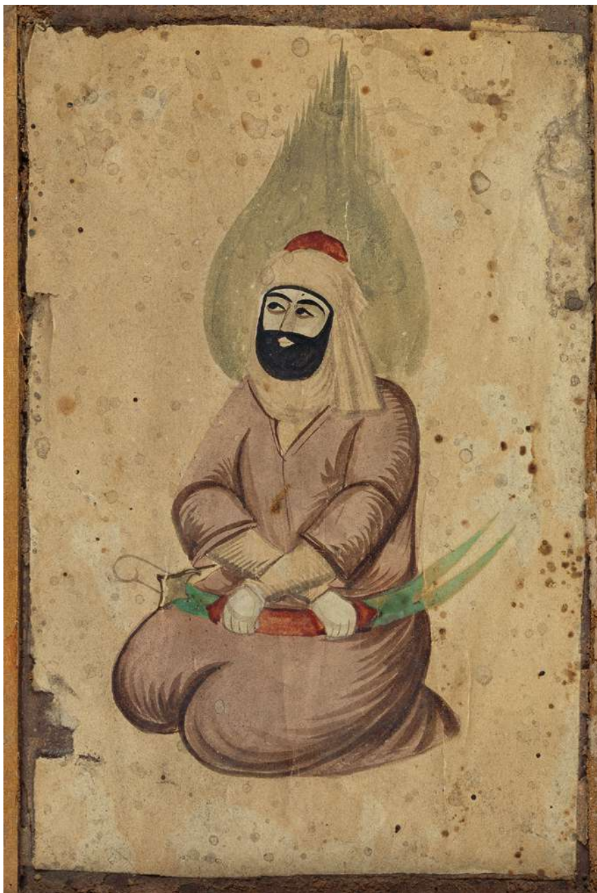
FIGURE 2 Watercolour on paper (13.5 × 6.5 cm), inv. no. 2003, 197, 5 and 10 © D. ADAM, MUECM, 2005