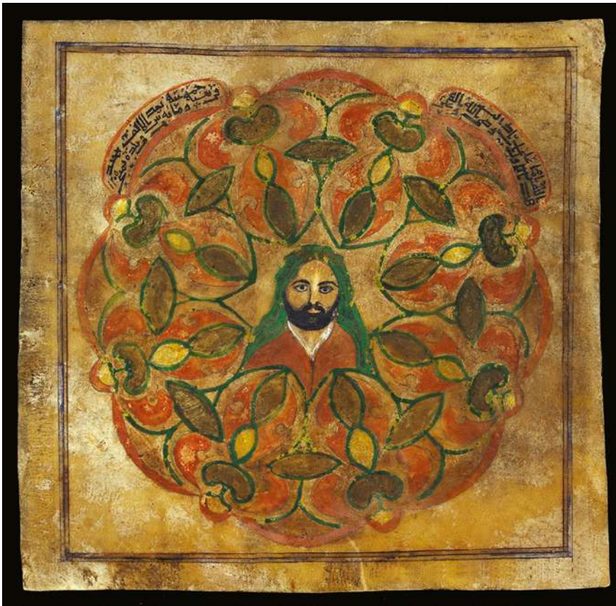
FIGURE 5 Watercolour on paper (24 × 23 cm), inv. no. 2003, 197, 12

without becoming similar to the sun, nor could a soul see beauty without being beautiful.” Even more relevant to our topic is this inscription about its icons in a tenth-century oriental church: ‘Small is the image you have under your eyes; immense is he who bears the image of the Infinite [in himself]. Revere the original, of which here you only have the image.’ 44 This iconic function of the shamā’il is equally manifest in another piece of the Vesel collection, an icon made in India on which ‘Alī’s portrait is surrounded by a sort of mandala, an aid to meditation and contemplation in several Indian religions and faiths. 45